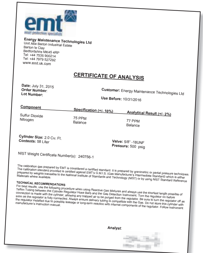
Certificate of analysis